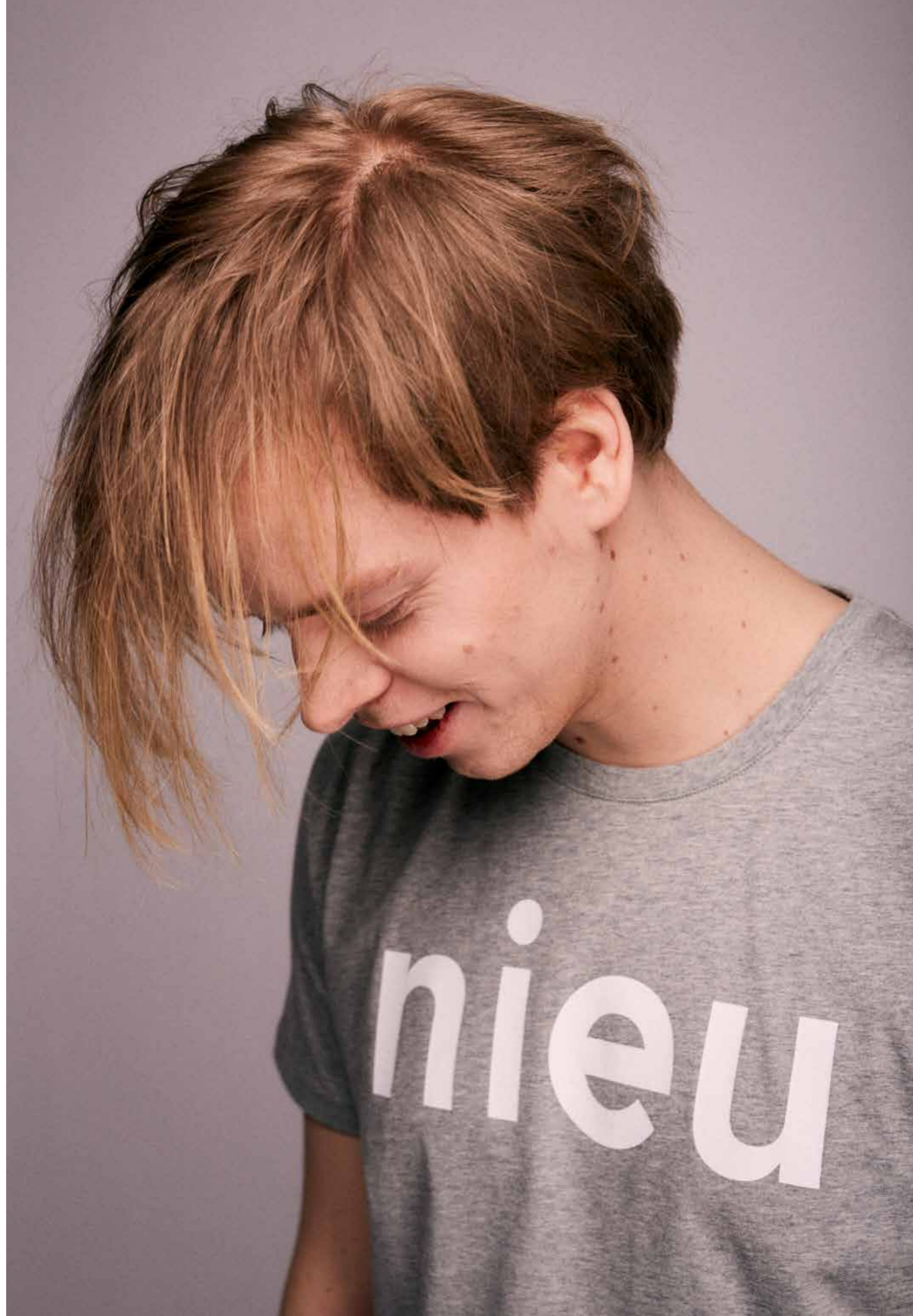
nieu straight tee