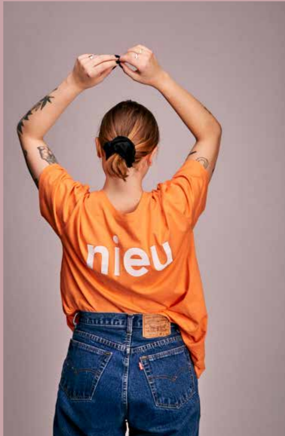
nieu straight tee