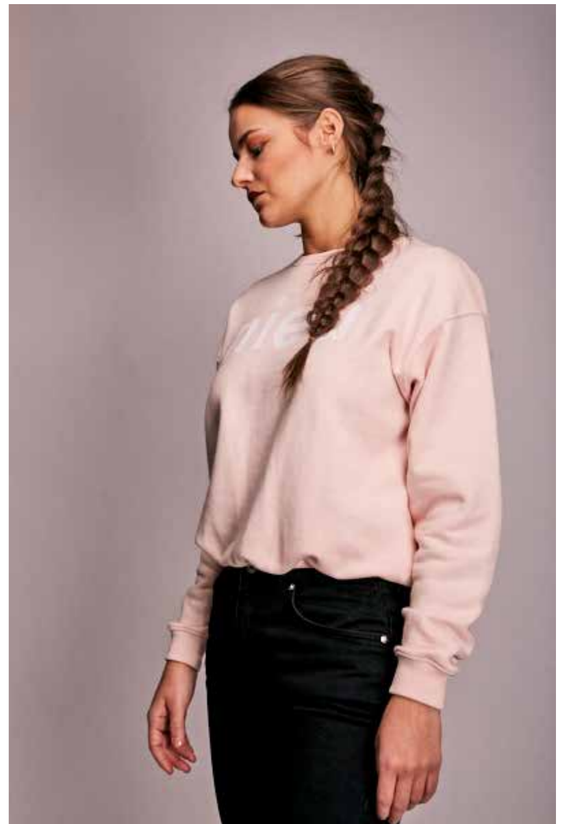
nieu boxy logo