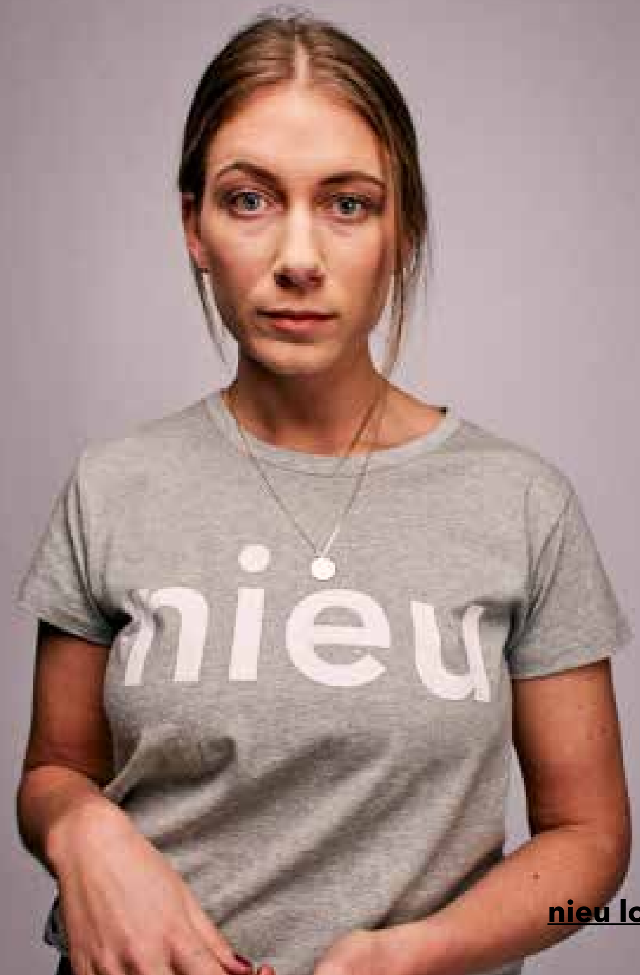
nieu logo tee