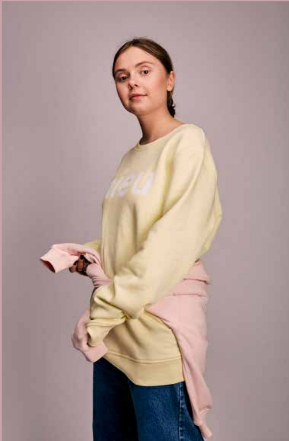
nieu straight sweat logo