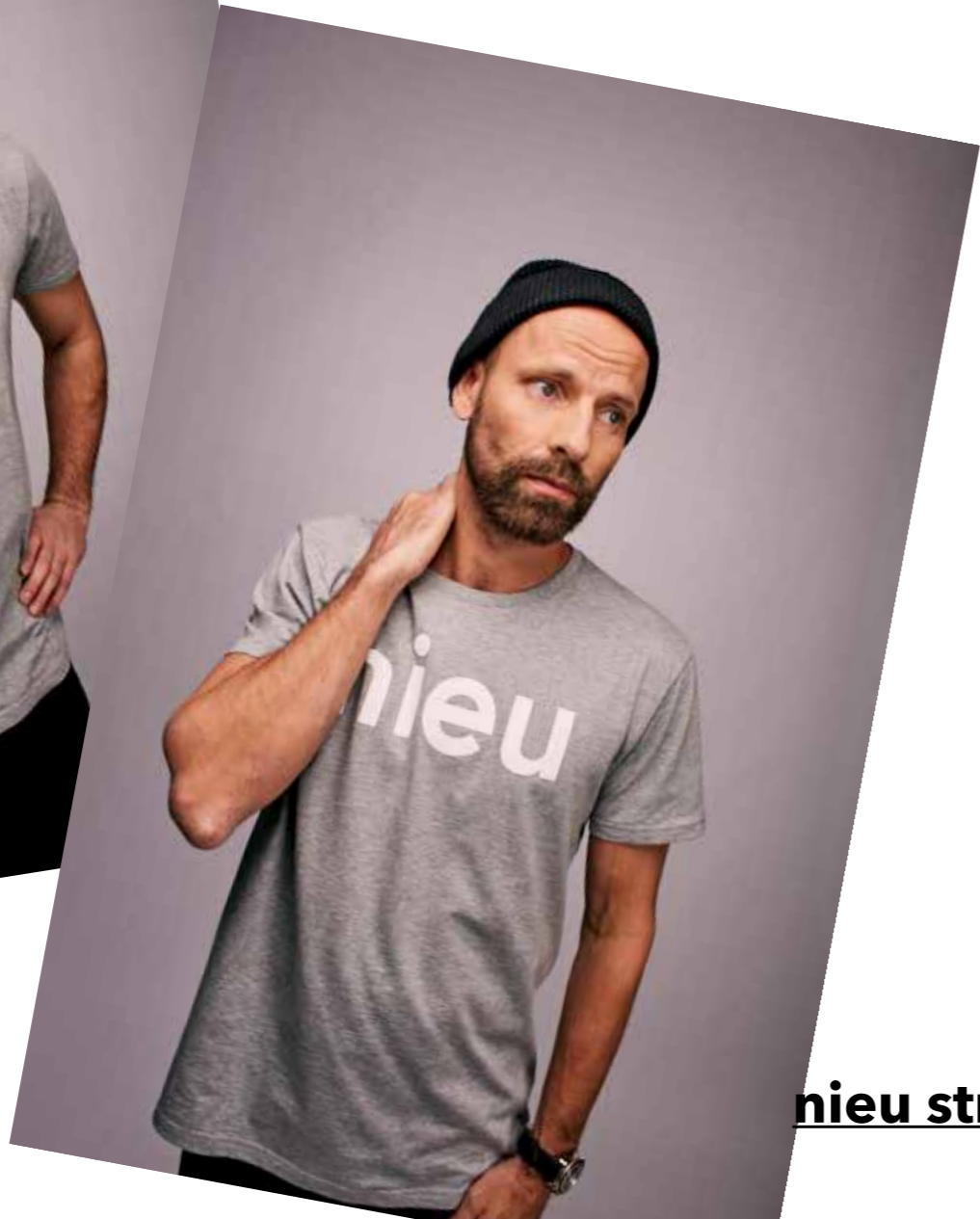
nieu straight tee