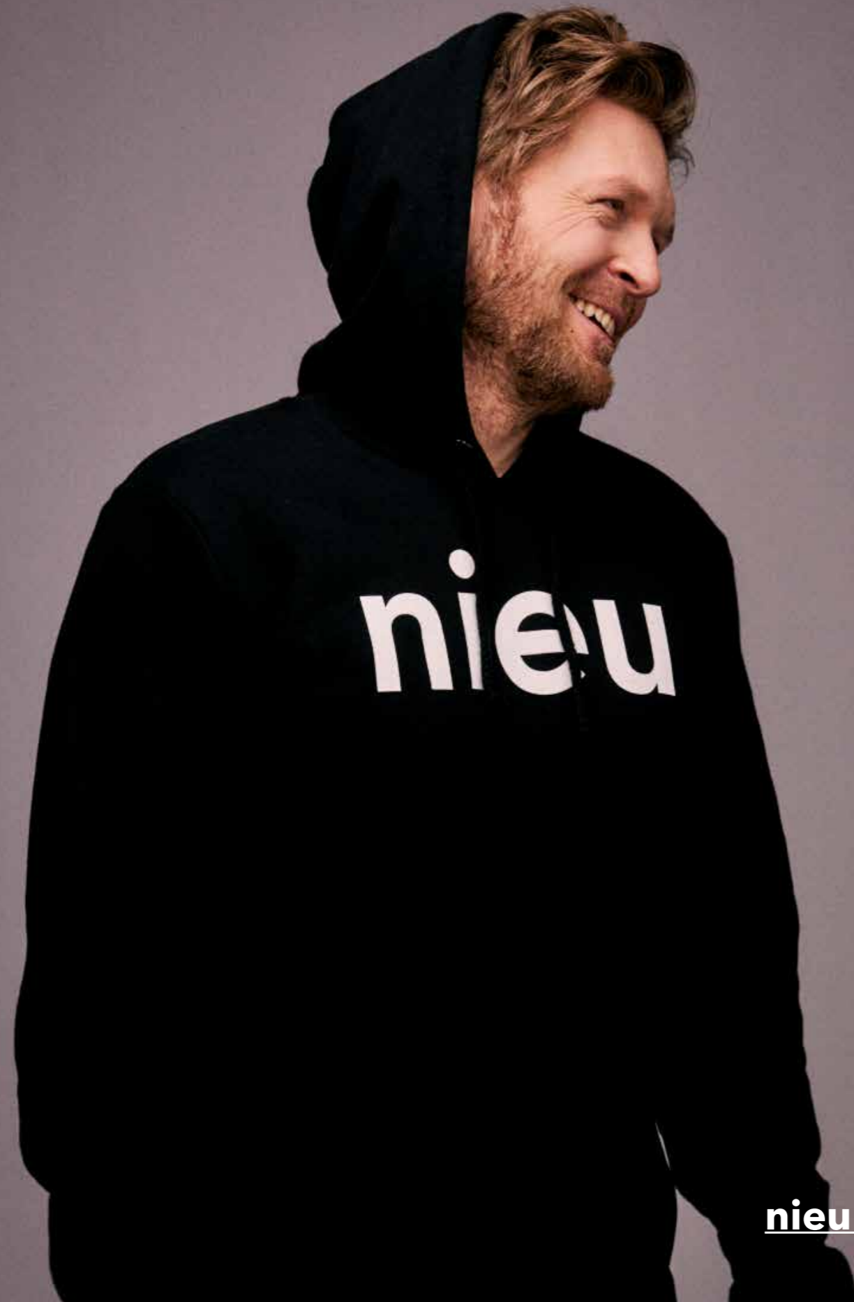
nieu hoodie logo