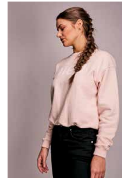
nieu boxy logo