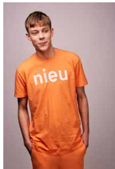
nieu sweat pant