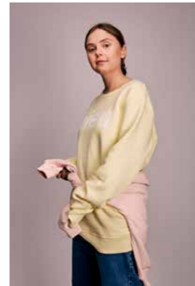
nieu straight sweat logo