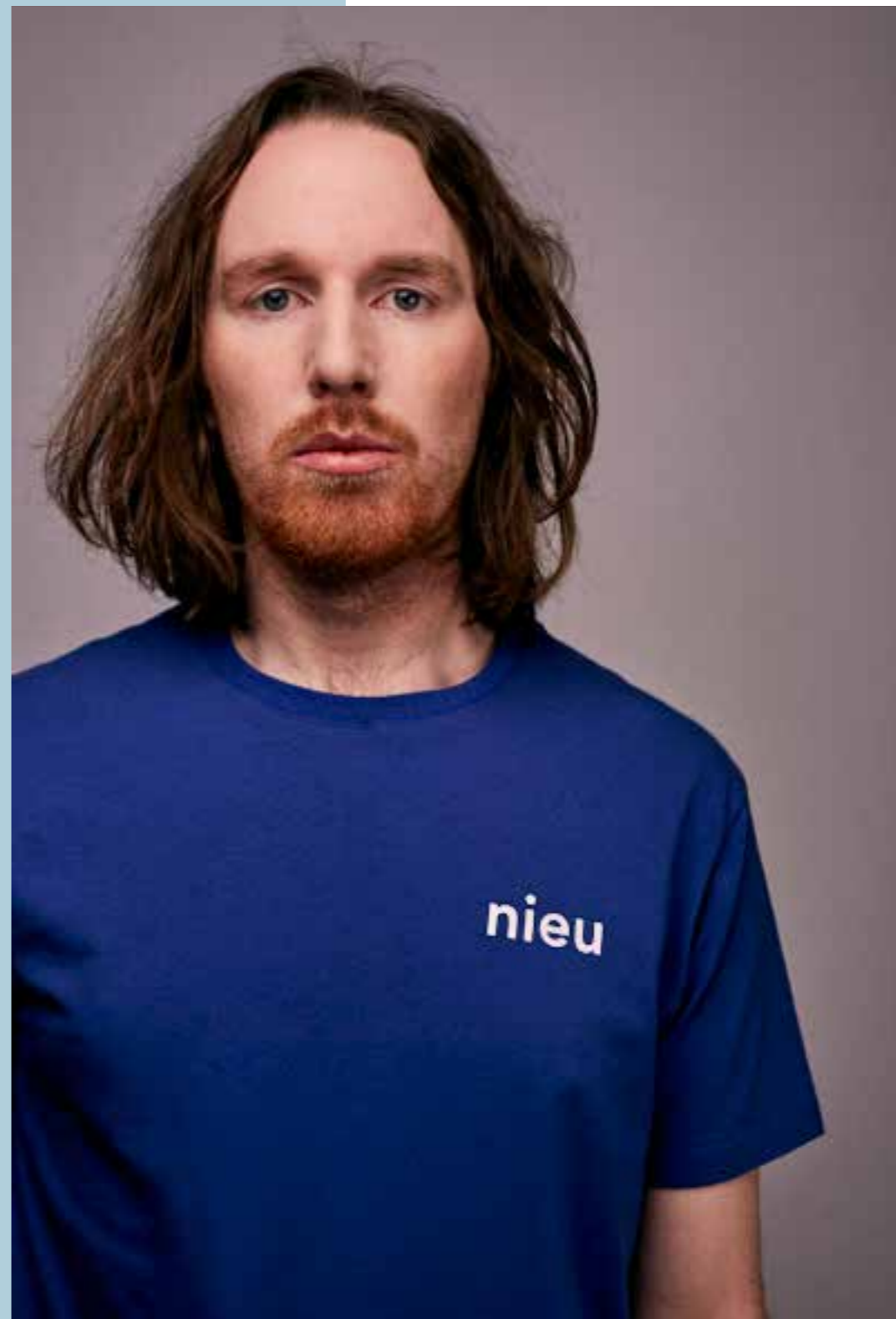
nieu straight tee