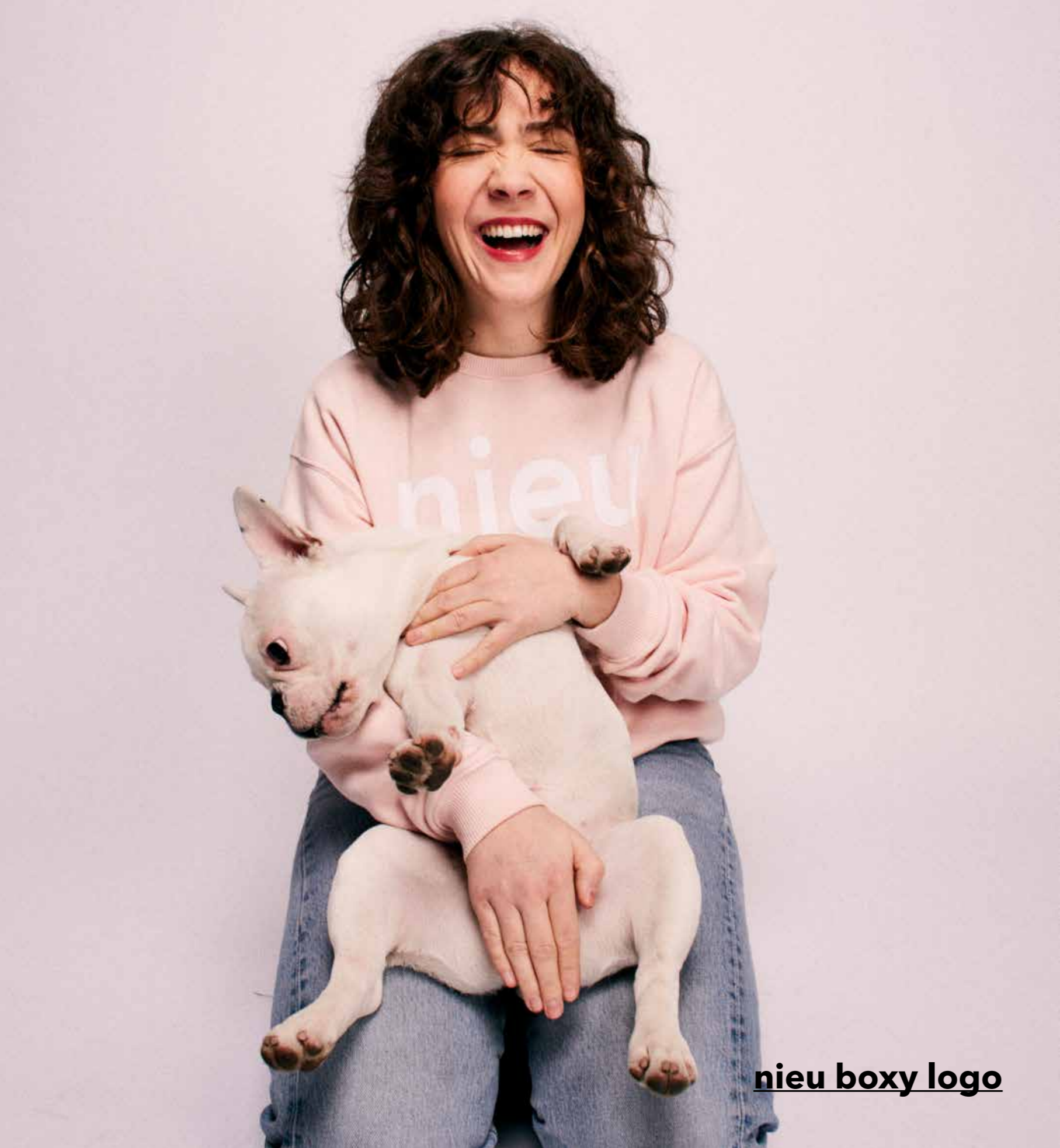
nieu boxy logo