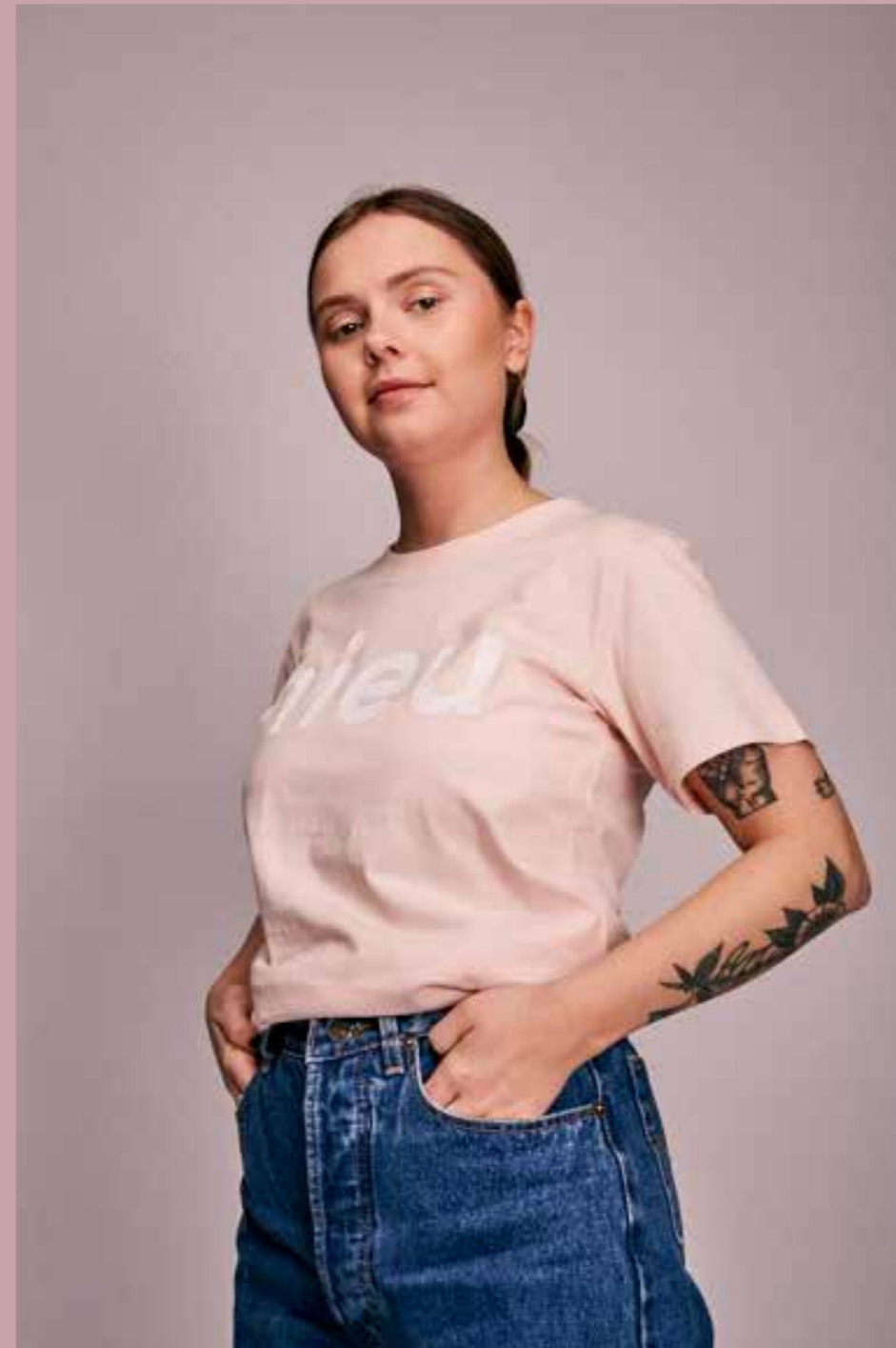
nieu logo tee