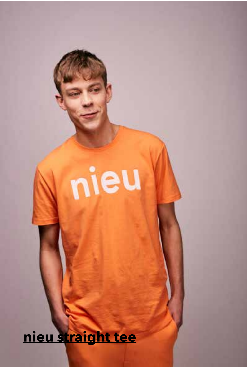
nieu straight tee