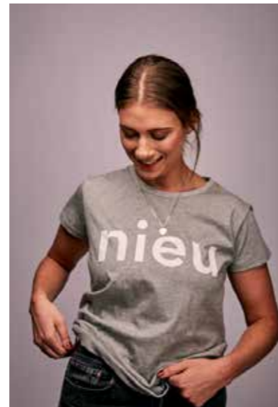
nieu logo tee