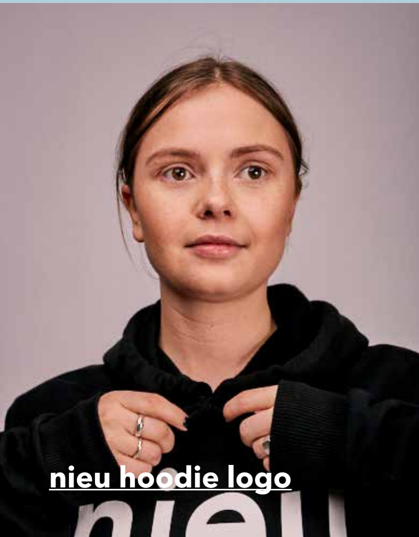
nieu hoodie logo