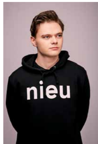
nieu hoodie logo