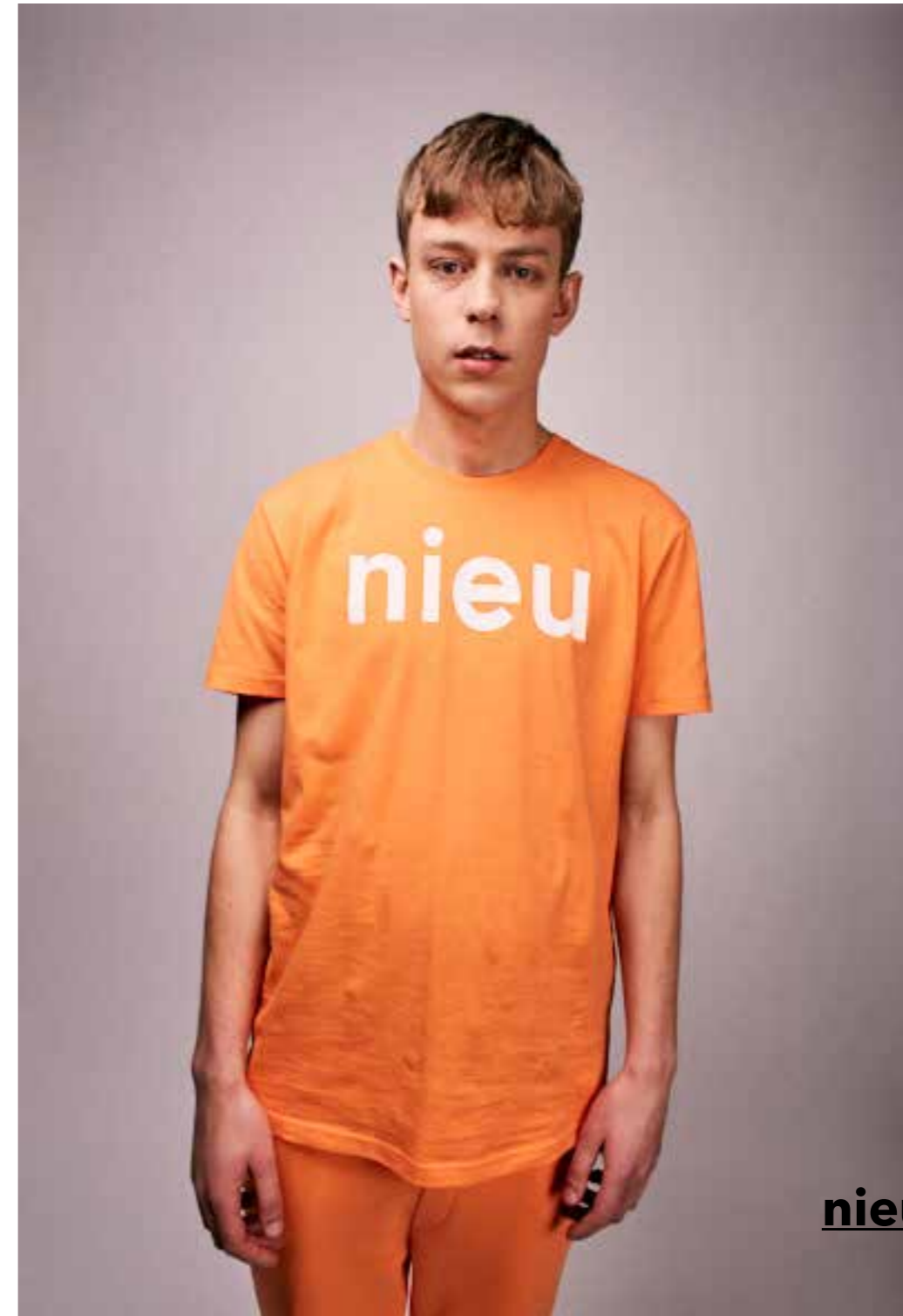
nieu sweat pant