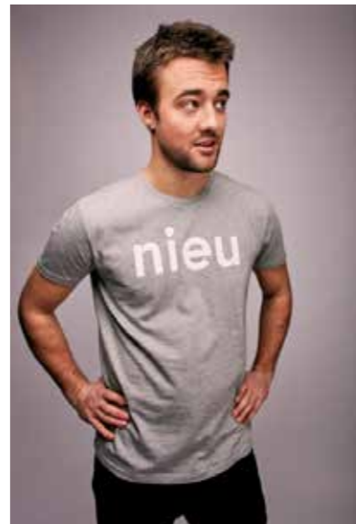
nieu straight tee